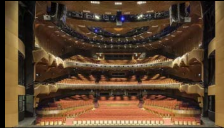
Turkcell Stage (Capacity: 2,313)