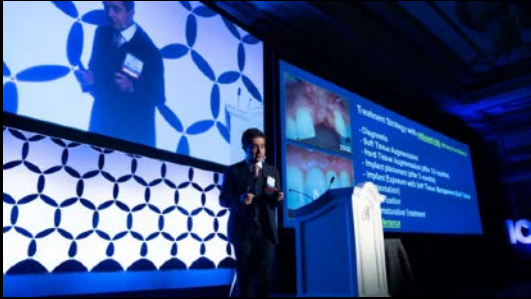
International Dental Congress (ICOI CONGRESS in Las Vegas, Istanbul, and Antalya)