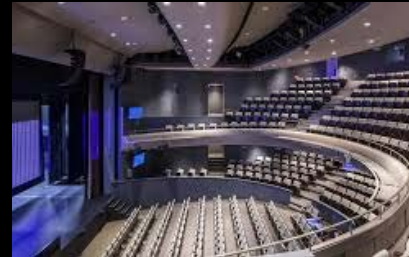
Turkcell Platinum Stage (Capacity: 709)