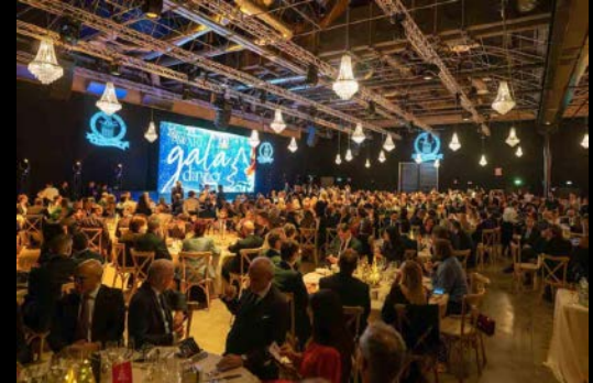
Private gala dinner held in Milan, Italy for various famous companies