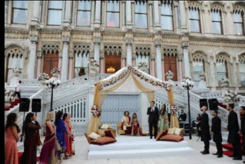
Wedding at the Kempinski Hotel in Istanbul