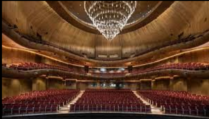
AKM Theater Stage (Capacity: 781)

We have strong connections with the most famous venues in Istanbul, Turkey.