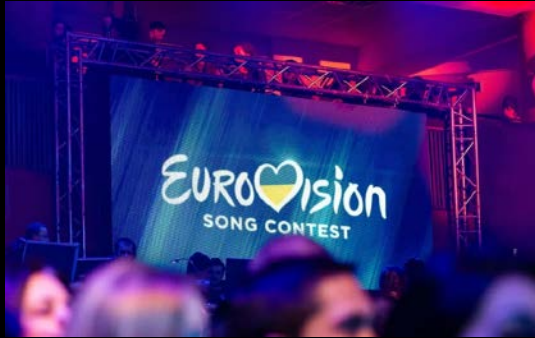
Eurovision Song Contest Final