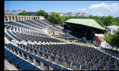
Cemil Topuzlu Amphitheater (Capacity: 3,972)