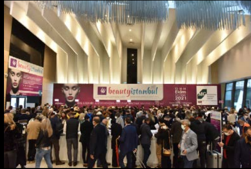
Istanbul International Beauty Exhibition