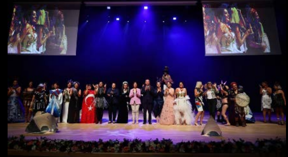
Pamukkale Music Festival held three times